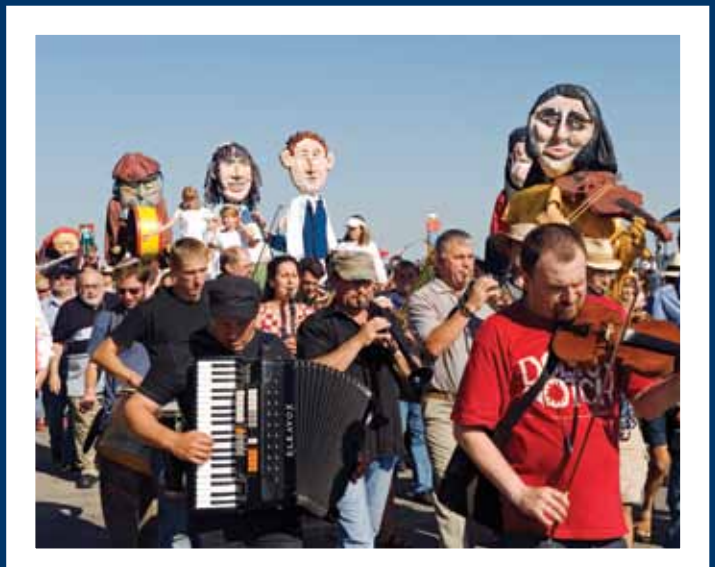
The Ashkenaz Festival: An artistic display of Jewish culture