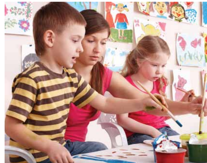
Enriching the lives of developmentally disabled children at Reena